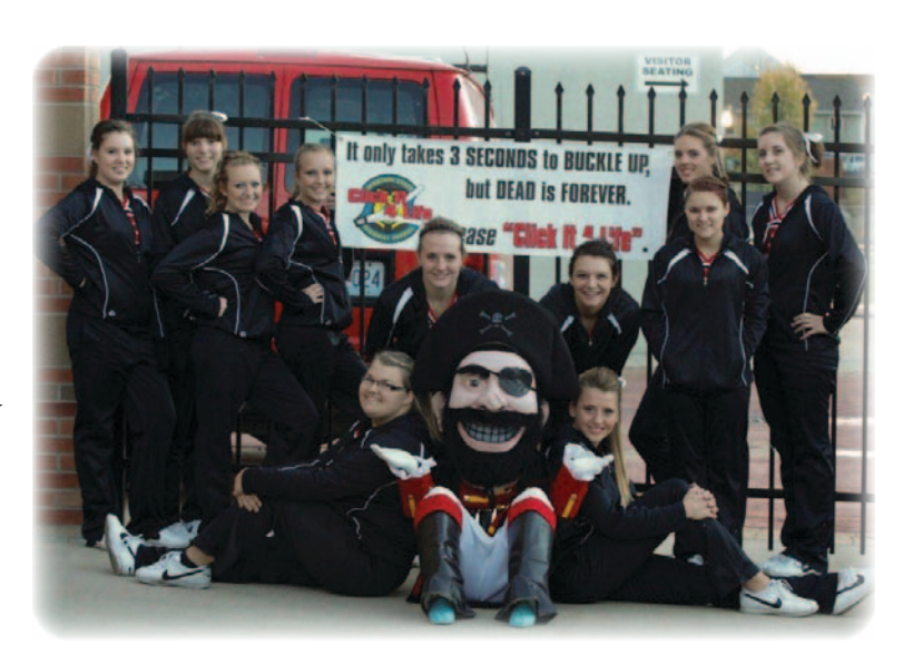
Hannibal High School cheerleaders gather around the "Click It 4 Life" banner before a playoff game.

Two events have been conducted in the Troop B area and were welcomed warmly by spectators attending the sporting events. On October 31, 2012, T-shirts were thrown to the crowd during the Hannibal High School playoff football game; on November 20, 2012, a similar event was held during halftime at the first Macon High School basketball game. During both events, the "Click It 4 Life" banner was displayed, local cheerleaders threw T-shirts out to the crowd, and public service announcements were read over the public address system.