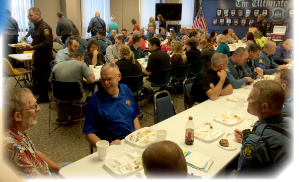
Troop D employees and retirees enjoyed lunch together to mark the Patrol's 85th anniversary.