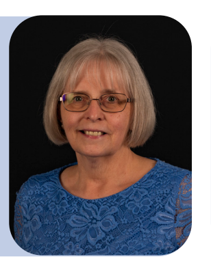
Chief Operator Troop H

Retired December 1, 2022. Six years, six months of dedicated service.