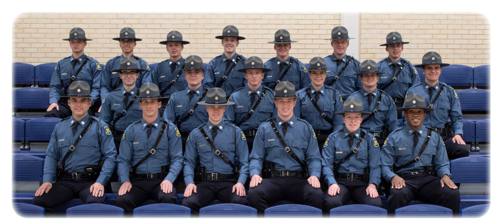
Congratulations to the 115th Recruit Class!