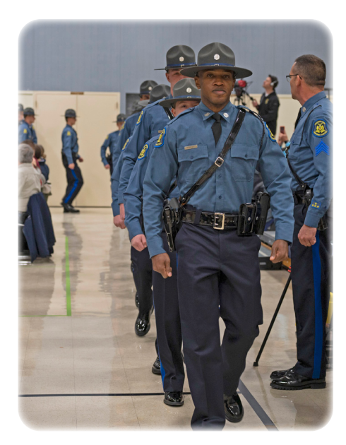
Members of the 115th Recruit Class enter the Academy gymnasium signifying the graduation ceremony has begun.

The new troopers reported for duty in their assigned troops on January 9, 2023.