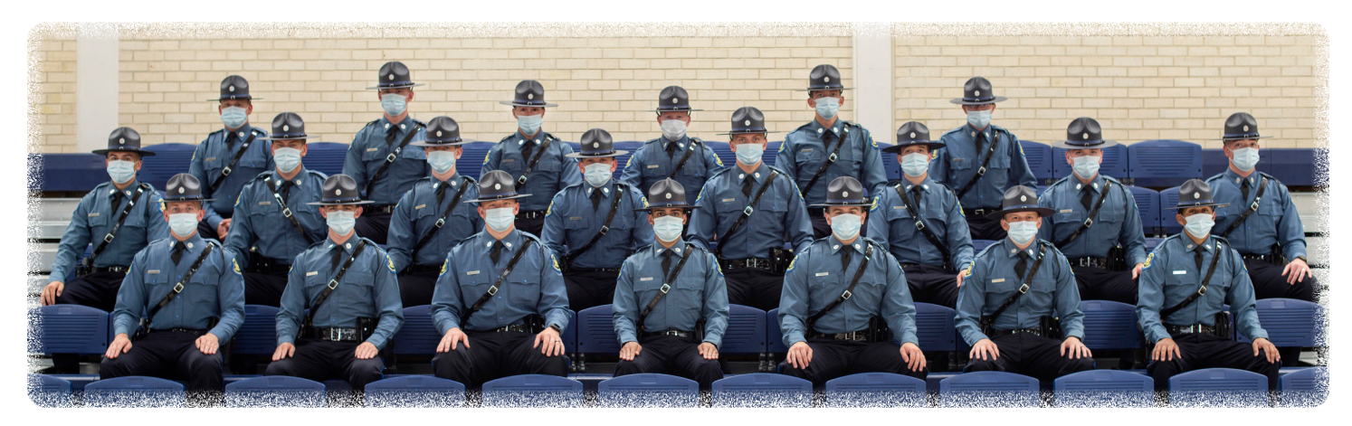
The coronavirus even influenced the official class picture of the 109th Recruit Class. The new troopers were spaced apart and wore masks until the photographer was ready to take the photo and immediately thereafter.