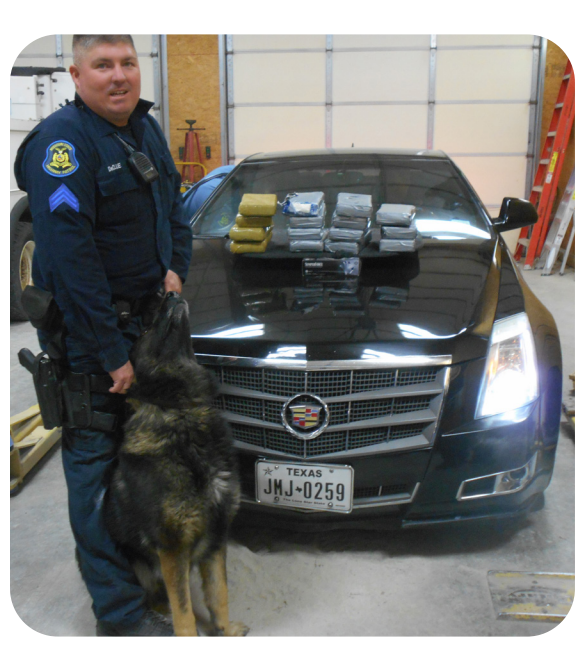
The Cuba, MO, Police Department called upon K9 Bruno to help them locate this seizure of over 40 pounds of marijuana.