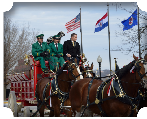
The Clydesdales give Missouri's new governor a lift to the Governor's Mansion.