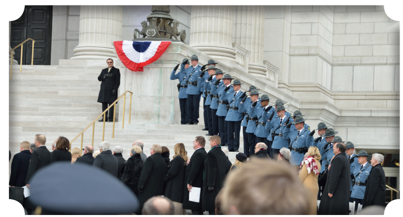
A line of troopers (seen here) and National Guardsmen framed the Capitol steps during the inauguration. Here, they are saluting during the Pledge of Allegiance.