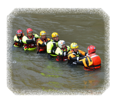
A group practices making a rescue. The first person acts as an anchor (facing backward) while the line moves to rescue a stranded "victim."