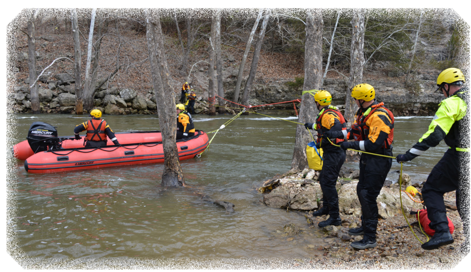
Students practice moving a rescue boat using the high line.