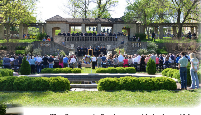
The Governor's Gardens provided a beautiful place for Missouri's Law Enforcement Ceremony on May 5, 2018.