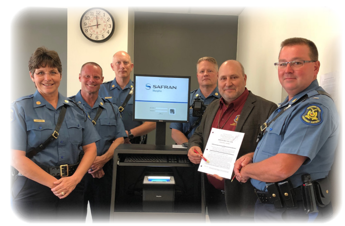
House Bill 1350 authorizes Rap Back.

Rap Back is an answer to concerns about one-time criminal history record checks being conducted on persons in positions of public