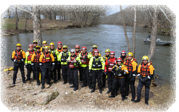
Swiftwater 1 Class of 2018 paused for a group photo during training.