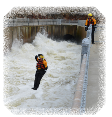
Taking a leap of faith: Each student enters the swiftwater and must maneuver themselves to safety.