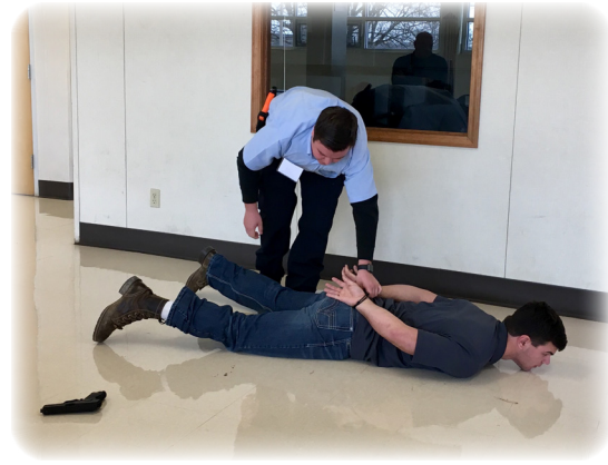
Making an "arrest" was part of the SkillsUSA competition.