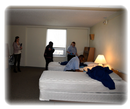
Students investigate a mock crime scene in these photos.