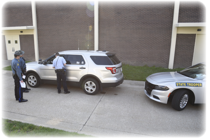
A student is evaluated by two troopers at a mock traffic stop.