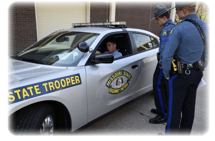
When this student "called" in information using the patrol car radio, he was assessed by the two troopers. One of the troopers "answered" his radio call as part of the competition.