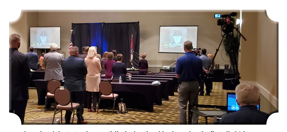
Award recipients stood respectfully during the video honoring the Patrol's 31 heroes who died in the line of duty.

to the stage, in the correct order. During the event, our photographer was taking pictures and our multimedia unit operated video cameras while our social media specialist oversaw the FB live.