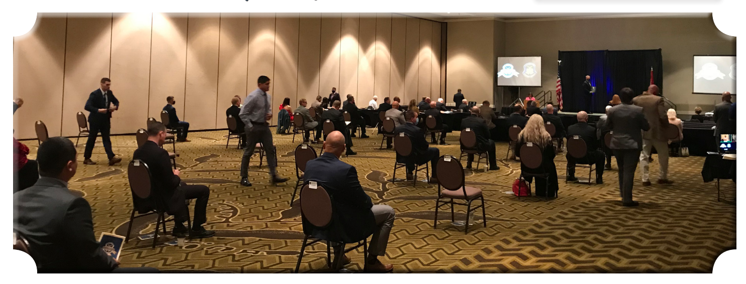
The recipients observed social distancing while waiting to accept their awards.