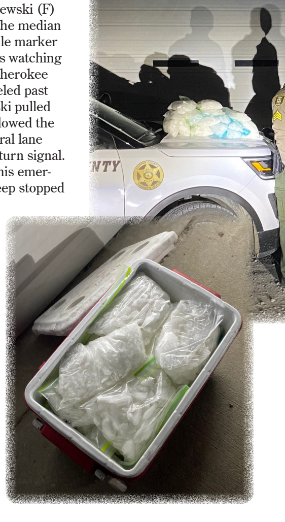
The ice in this cooler wasn't keeping anything cold