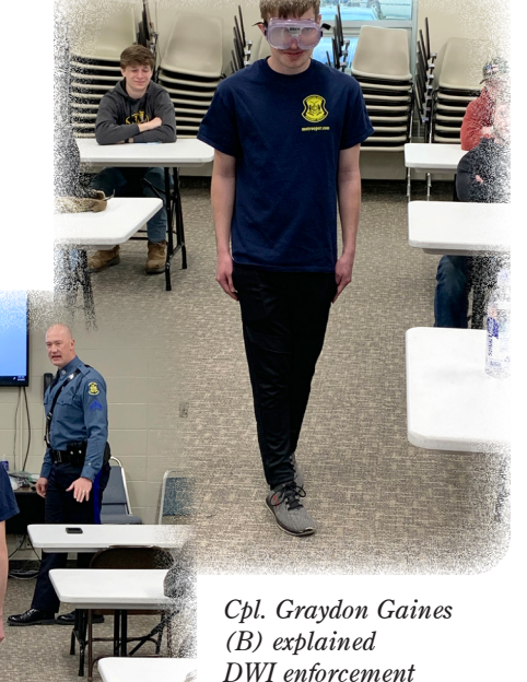
DWI enforcement to students in the alliance program.