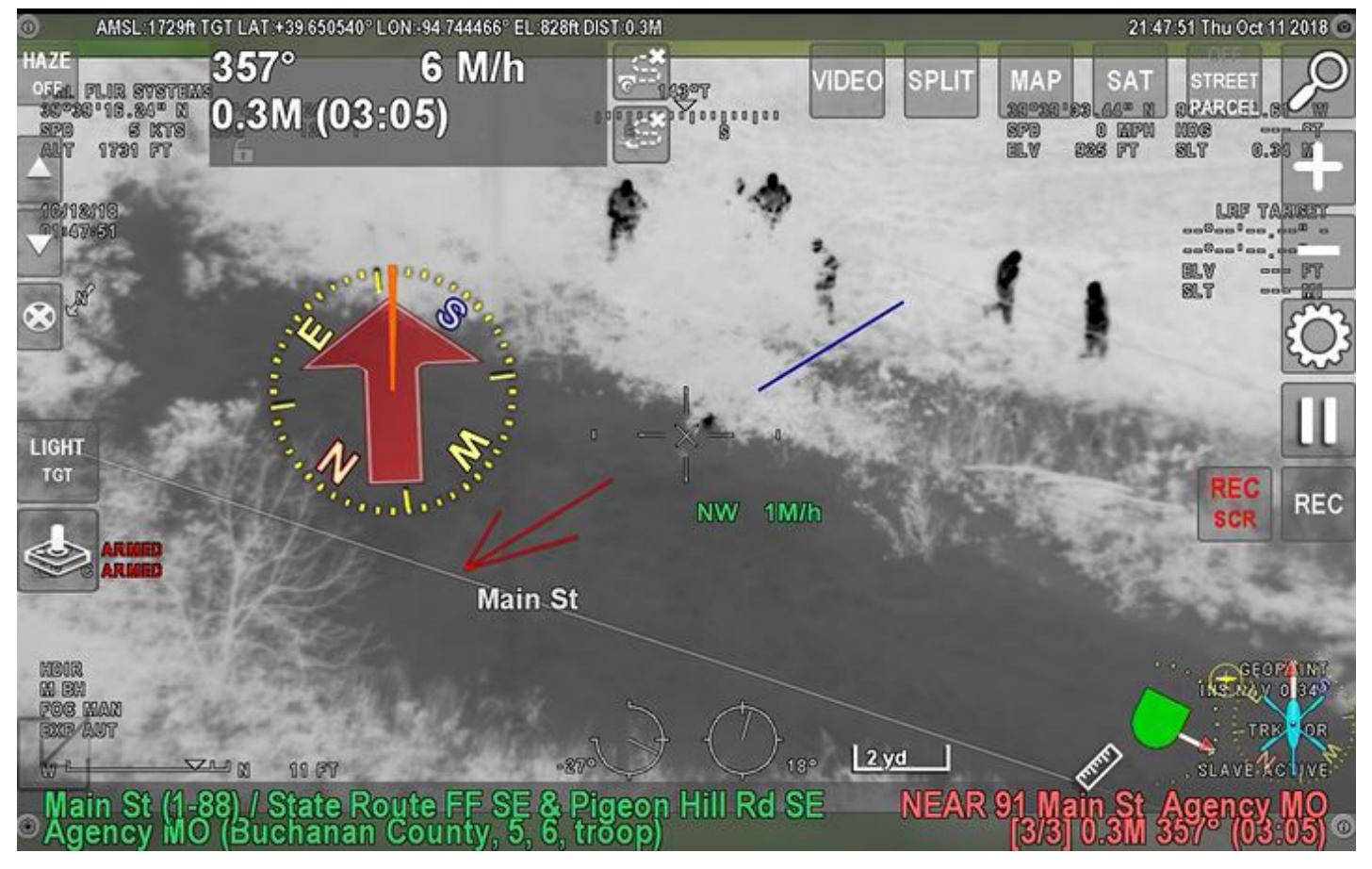
In this screen shot from the helicopter FLIR camera, the suspect appears as a small black dot near the crosshairs (center of screen). He is hiding from officers in the flood waters and is obscured by trees.

The Patrol helicopter has participated in several fleeing vehicle operations this year in the St. Joseph metropolitan area. During similar operations across the state, the high definition camera and mapping system have been successful in assisting ground officers to safely apprehend those drivers who flee, thus reducing the danger to the public during vehicular pursuits.