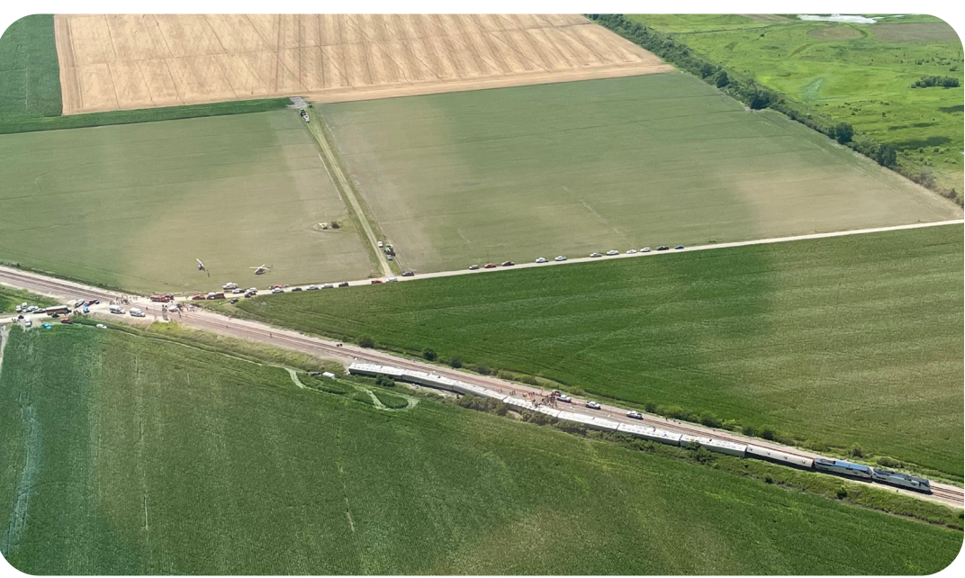
These photos show an aerial view of the derailed Amtrak in Mendon, MO.

When you look at the aerial photos, you see the train and it looks as serious as it was. But, arriving on scene, seeing the chaos of the situation, the victims on back boards on the tracks, victims and family members walking around looking for loved ones, first responders of all departments on the derailed train with ladders assisting victims exiting through the train's windows and doors, you are in a situation you never want to see or experience. As a professional, you jump into action and begin assisting wherever you