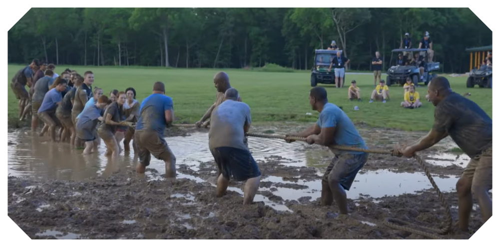
The Patrol members on staff and Youth Academy Program cadets enjoyed a friendly tug-of-war challenge in the mud pit.

This past summer, Recruiting and Community Outreach Division personnel hosted two Youth Academy programs. The first was from May 30-June 3, at Eagle Sky of the Ozarks in Patterson, MO, and the second was from July 28-31, at Camp Mihaska in Bourbon, MO. Between the two locations, 49 students from all areas of the state, ages 16-18, participated in the academies. During each week, the youth were exposed to the various duties and careers available within the Patrol, both member and civilian. They also participated in team building exercises and confidence building challenges, while forming relationships and having fun. Here's what a few of the participants had to say about the Patrol Youth Academy: