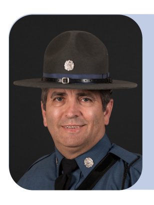
Sergeant Troop E

Retired August 1, 2022. 29 years, eight months of dedicated service.